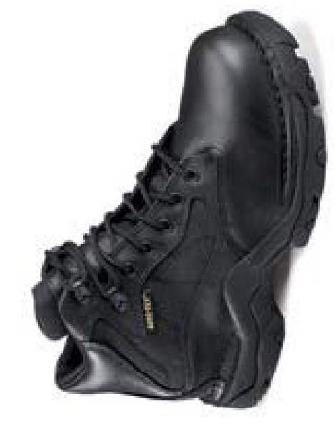
#5 is acceptable if lettering on label is blacked-out.